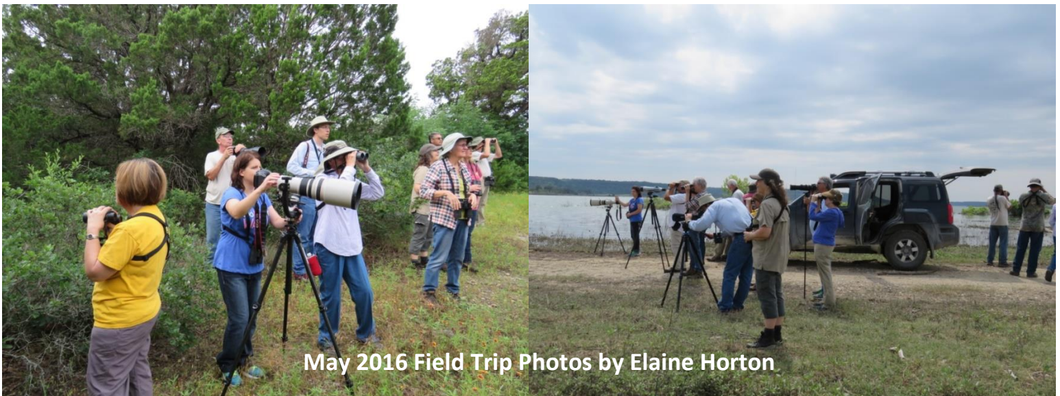
May 2016 Field Trip Photos by Elaine Horton