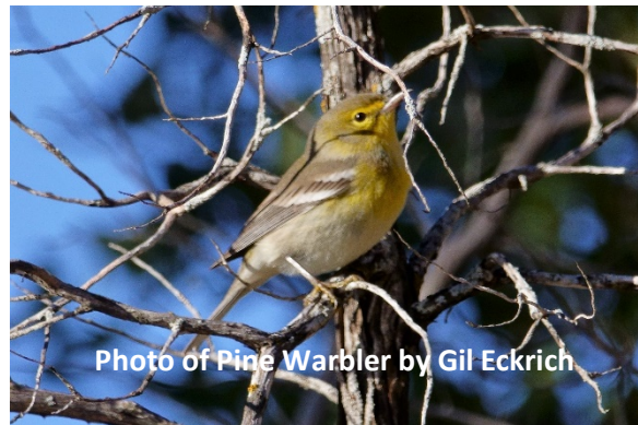
Photo of Pine Warbler