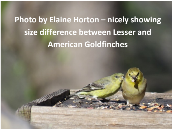
nicely showing size difference between Lesser and American Goldfinches

14 May - Picture Show and Tell , Everyone bring pictures to share! Please bring your pictures in digital format, either on a jump drive, or a CD/DVD. This has become a favorite event, and contributors are asked to limit themselves to no more than 10 images, unless otherwise coordinated in advance.