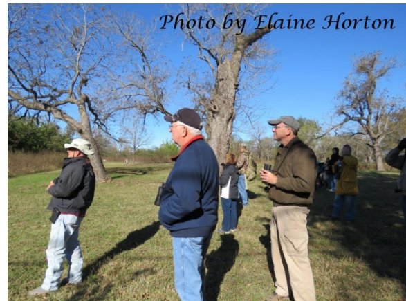
Photos from Nov 2016 Field Trip